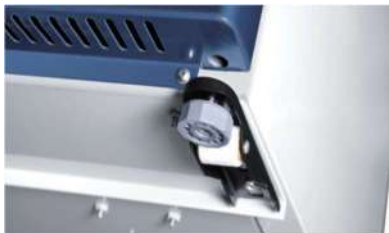
Caster and feet