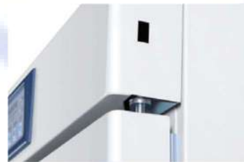
USB data logging Optional